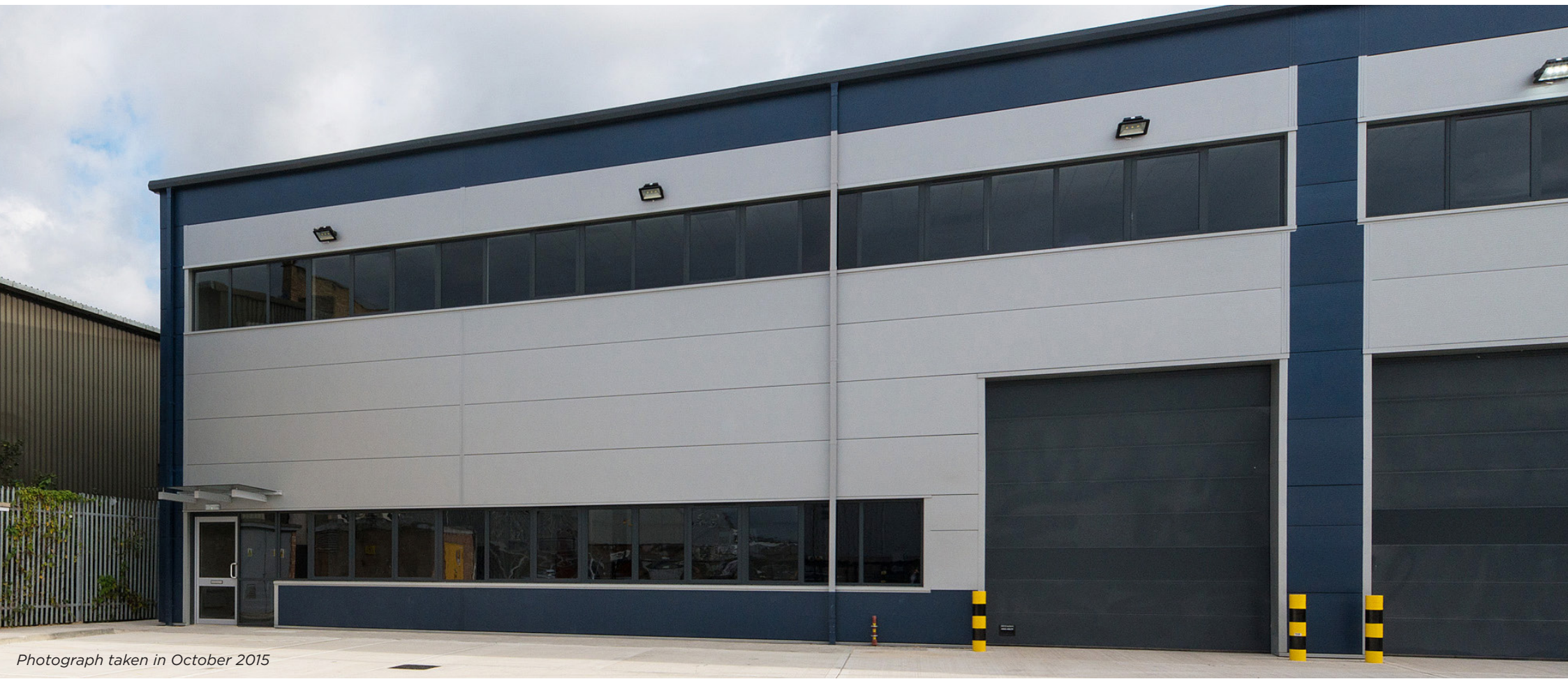
Photograph taken in October 2015

WAREHOUSE / INDUSTRIAL UNIT TO LET // 11,175 sq ft (1,038.10 sq m)