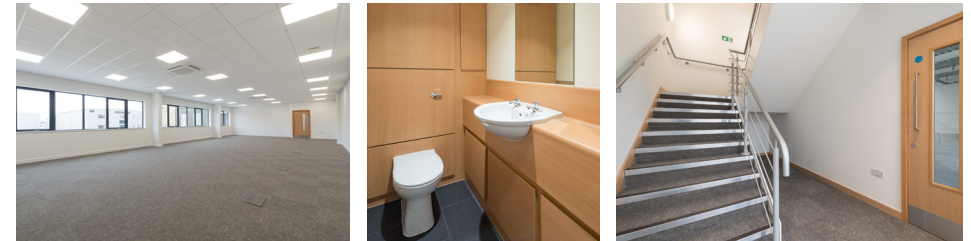
Photographs taken in October 2015